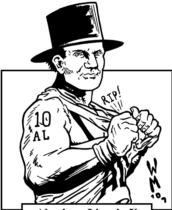
Abraham Lincoln X

6'4" -- 242 lbs -- from: Hodgenville, Kentucky