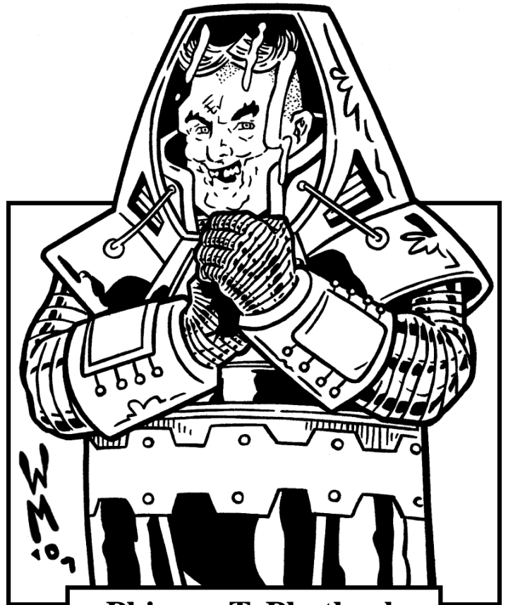
Phineus T. Phatback

6'4" -- 242 lbs -- from: Hodgenville, Kentucky